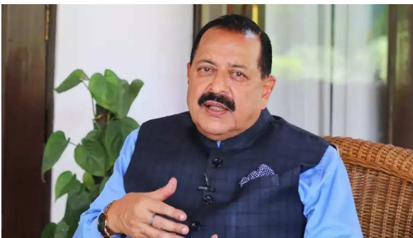
THE KASHMIR TALK BUREAU NEW DELHI:

In a major policy shift aimed at streamlining the research environment in India, Union Minister of State (Independent Charge) for Science and Technology, Earth Sciences and Minister of State for PMO, Department of Atomic Energy, Department of Space, Personnel, Public