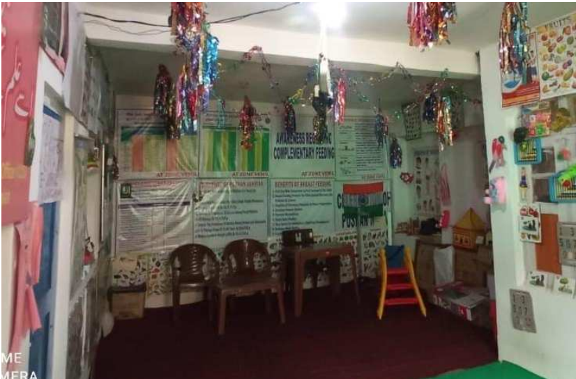
THE KASHMIR TALK BUREAU SHOPIAN:

2984 new beneficiaries enrolled in 03 months in the district