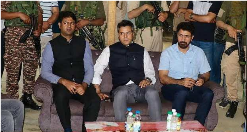
THE KASHMIR TALK BUREAU SRINAGAR:

Emphasises on ensuring robust arrangements for seamless conduct of the annual pilgrimage