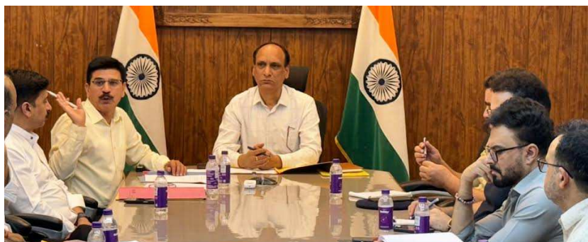
THE KASHMIR TALK BUREAU DODA:

The annual meeting of the Zila Sainik Board Doda was convened today in the Mini Meeting Hall of the DC Office Complex, Doda.