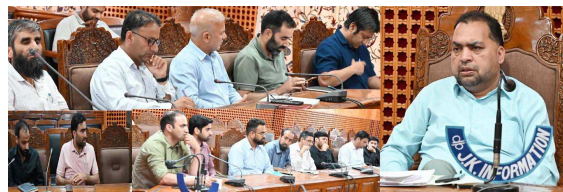
THE KASHMIR TALK BUREAU SHOPIAN:

Abhiyan to start from June 15 in Kathohalan & Pehlipora villages of Keller