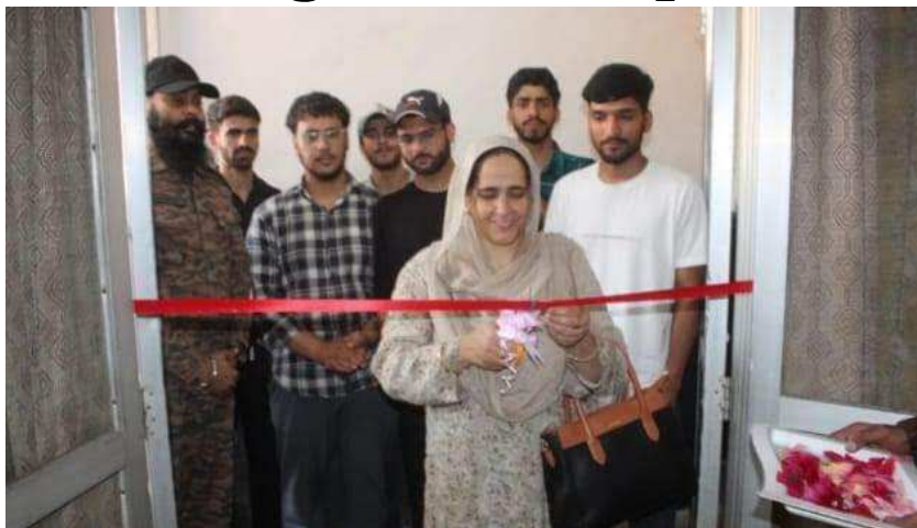
THE KASHMIR TALK BUREAU RAMBAN:

The pre-training classes for Agniveer aspirants under the Agnipath scheme commenced today with a solemn and inspiring opening ceremony held at Bn HQ, Karawa Camp Banihal. The event witnessed the presence of distinguished guests, training staff, and a large number of enthusiastic candidates who are preparing to serve the nation