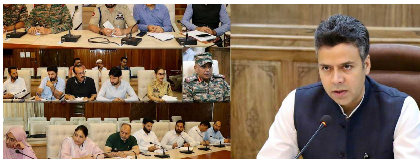
THE KASHMIR TALK BUREAU SRINAGAR:

Asks stakeholder departments to ensure all necessary arrangements well in advance for successful commemoration of the Day