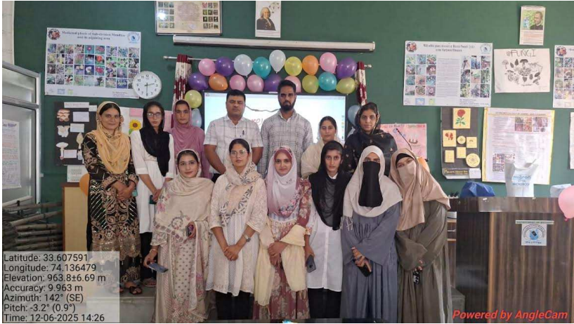
THE KASHMIR TALK BUREAU JAMMU:

Today (12/6/2025), the Department of Botany, SCS GDC Mendhar, held a heartfelt and memorable farewell party for the outgoing 6th semester students, hosted by their juniors from the 4th semester with the enthusiastic cooperation and support of the department's teaching and non-teaching staff.