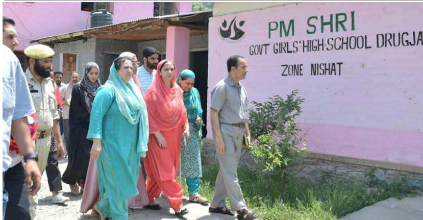
THE KASHMIR TALK BUREAU SRINAGAR:

Takes on-spot assessment of school's functioning, interacts with students, staff