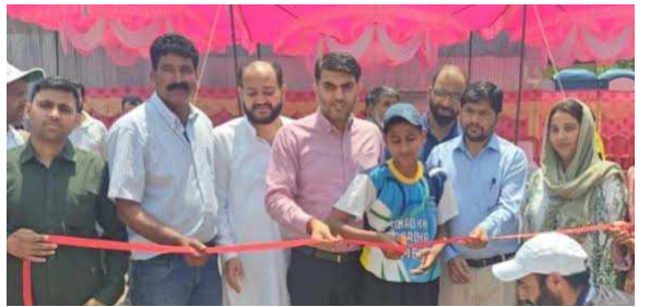
THE KASHMIR TALK BUREAU RAMBAN:

Over 335 student athletes from all six zones participate on inaugural day