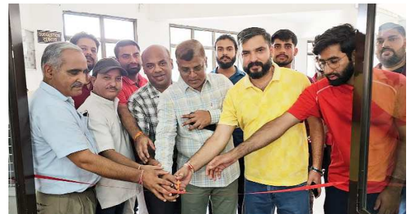
THE KASHMIR TALK BUREAU JAMMU:

In a pioneering step towards fostering student leadership and participatory governance, the University of Jammu has inaugurated a fully student-run mess at the Baba Jitto Boys Hostel (BJBH), marking a significant shift in hostel management and student engagement.