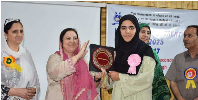
THE KASHMIR TALK BUREAU SRINAGAR:

Addresses World Environment Day-2025 week celebrations at GGHSS Kothibagh Calls for collective efforts for environmental preservation