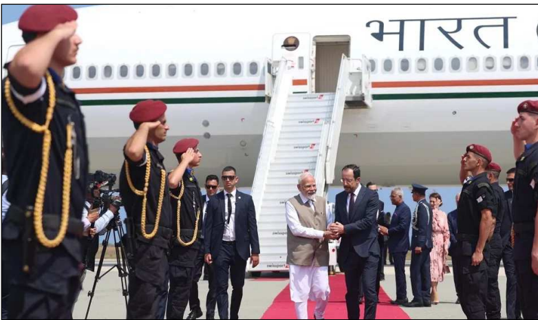
THE KASHMIR TALK BUREAU CYPRUS:

Prime Minister Narendra Modi Sunday arrived in Nicosia in Cyprus on a historic visit, the first by an Indian prime minister to the island nation in over two decades. "Landed in Cyprus. My gratitude to the President of Cyprus, Mr. Nikos Christodoulides for the special gesture of welcoming me at the airport. This visit will add signifi-