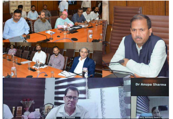
THE KASHMIR TALK BUREAU SRINAGAR:

Calls for seamless implementation of Central, UT-level schemes, enhanced beneficiary coverage