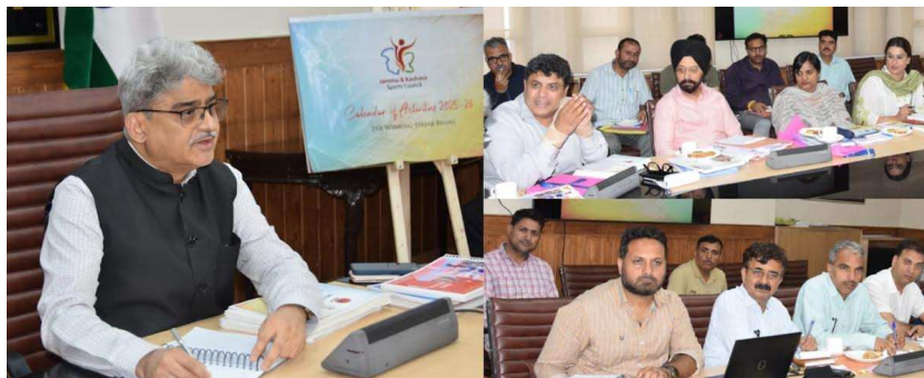
THE KASHMIR TALK BUREAU SRINAGAR:

Reviews Functioning of the Youth Services & Sports Department